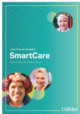
Health Plan document